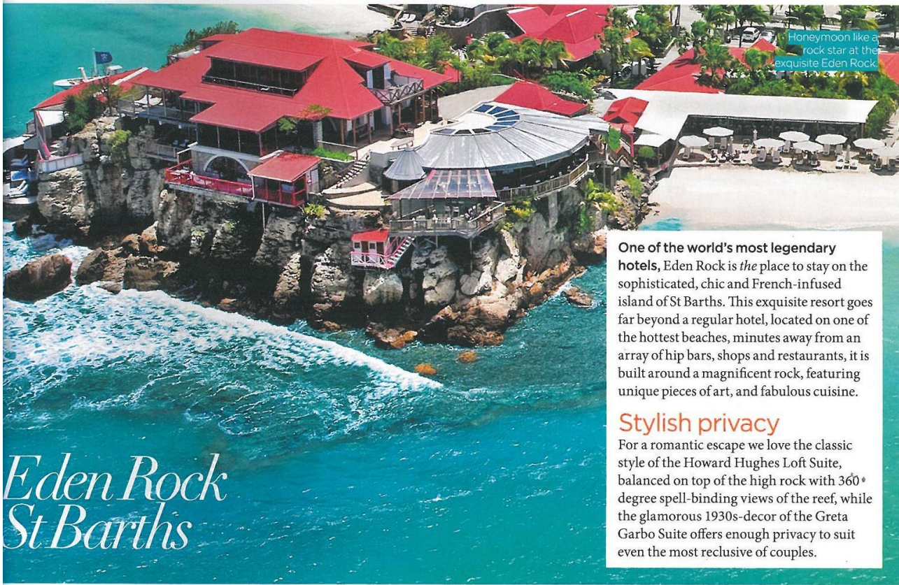
Honeymoon like a rock star at the exquisite Eden Rock