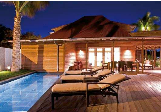
ON THE ROCKS FROM TOP The main building of Eden Rock is perched on a rocky outcrop; the big beach house at Eden Rock

recording studio. The four-suite property also has a bubble-shaped bathroom tiled in white gold, two pools with bars, a 20-seat screening room, and even a croquet lawn. Venture onto the nearby beach, the place for the bronzed and the beautiful to see and be seen, and you may well spot some real rock stars.