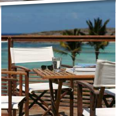
UNDER THE SUN CLOCKWISE FROM TOP Enjoy the sea breeze while dining at Le Restaurant des Pêcheurs at Le Sereno; minimalist chic at Le Sereno; a spa treatment at LeSereno

– not helped by the arid, mountainous landscape. It was “discovered” by Christopher Columbus in 1493 and after an interlude of Swedish rule, it was bought back by France in 1878. It wasn’t until a century later that it was reinvented, when the jetset crowd stumbled upon the off-the-beaten-track destination and started injecting money and cachet. Ever since, it’s been an A-list magnet while deliberately conserving its Gallic charm and exclusivity. The island’s leaders have resisted mass tourism – there are upscale boutique resorts, but no hotel chains.