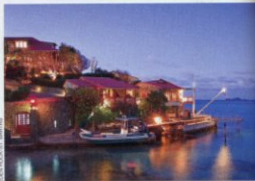
EDEN ROCK/ST. BARTHS

St. Barts also has a cottage industry that produces fashion items that are trendy as well as practical for the island's uneven sidewalks. Flip-flops with bronze leather straps, decorated with turquoise, amber and gold stones, have rubber soles. Belts meant to be slung low on a skirt come in deep brown leathers, accented with tortoise