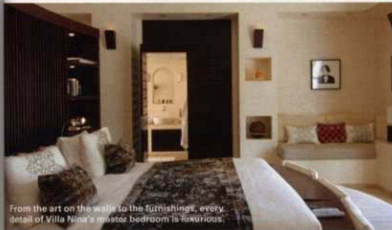
From the art on the walls to the furnishings, every detail of Villa Nina's master bedroom is luxurious.