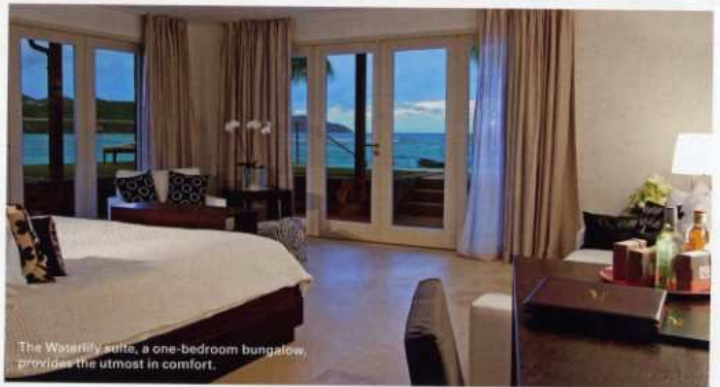
The Waterlily suite, a one-bedroom bungalow, provides the utmost in comfort.

The beauty and rapture of St. Barths is ideal and prized for its exclusivity, luxury and tranquility. After being captivated by the sun at the most completely extravagant Caribbean hot spot, you, too, might find yourself thinking, "If this is Eden, there's no doubt it is also heaven." ❧