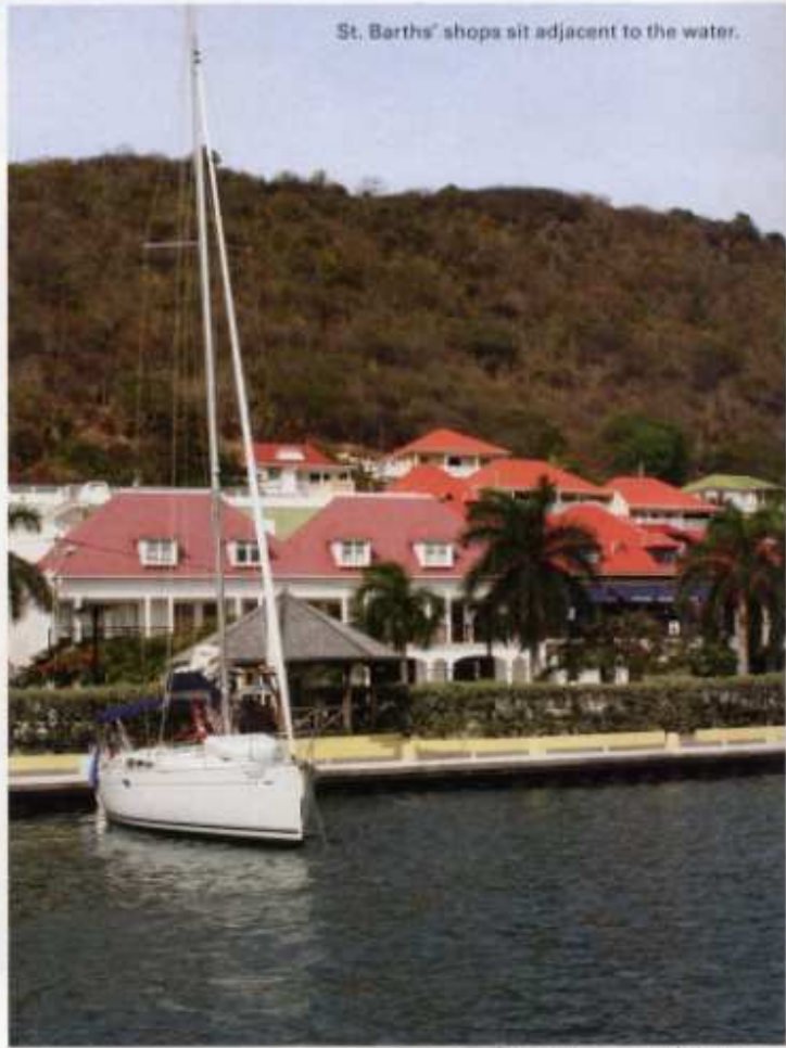
St. Barths' shops sit adjacent to the water.