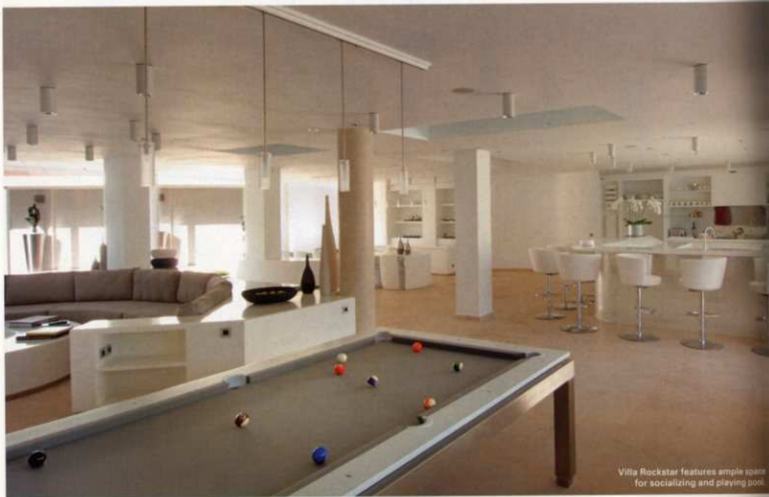
Villa Rockstar features ample space for socializing and playing pool.