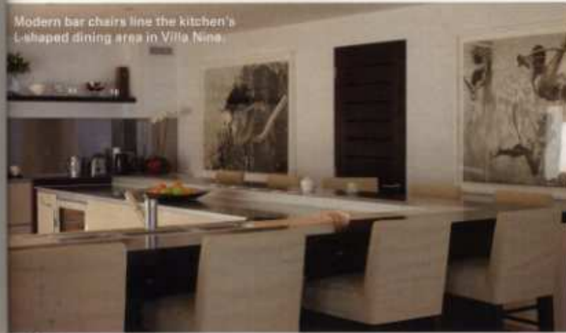
Modern bar chairs line the kitchen's U-shaped dining area in Villa Nina.