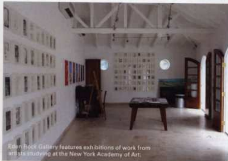
Eden Rock Gallery features exhibitions of work from artists studying at the New York Academy of Art.