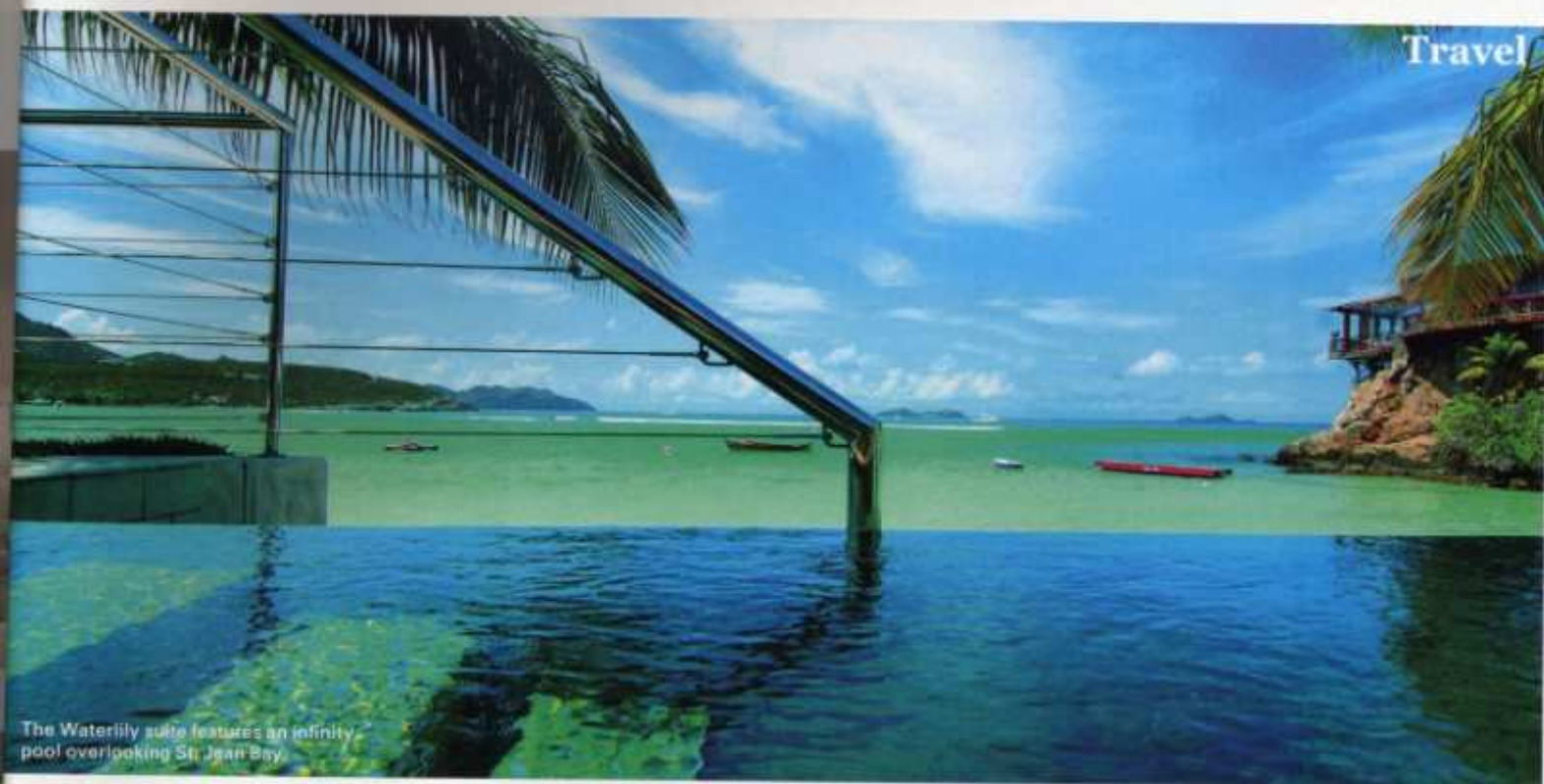
The Waterlily suite features an infinity pool overlooking St. Jean Bay.

of the coral reef that encircles the property. The hotel provides snorkeling gear, rafts and glass-bottom kayaks free of charge. Or hop on a Hobie Cat sailboat or grab windsurfing equipment at St. Jean beach. If you want to take a boat trip, simply ask the concierge to use one of the property's two vessels—the picnic boat Eden Rock and the 65-foot princess yacht Eden Rock-St. Barths .