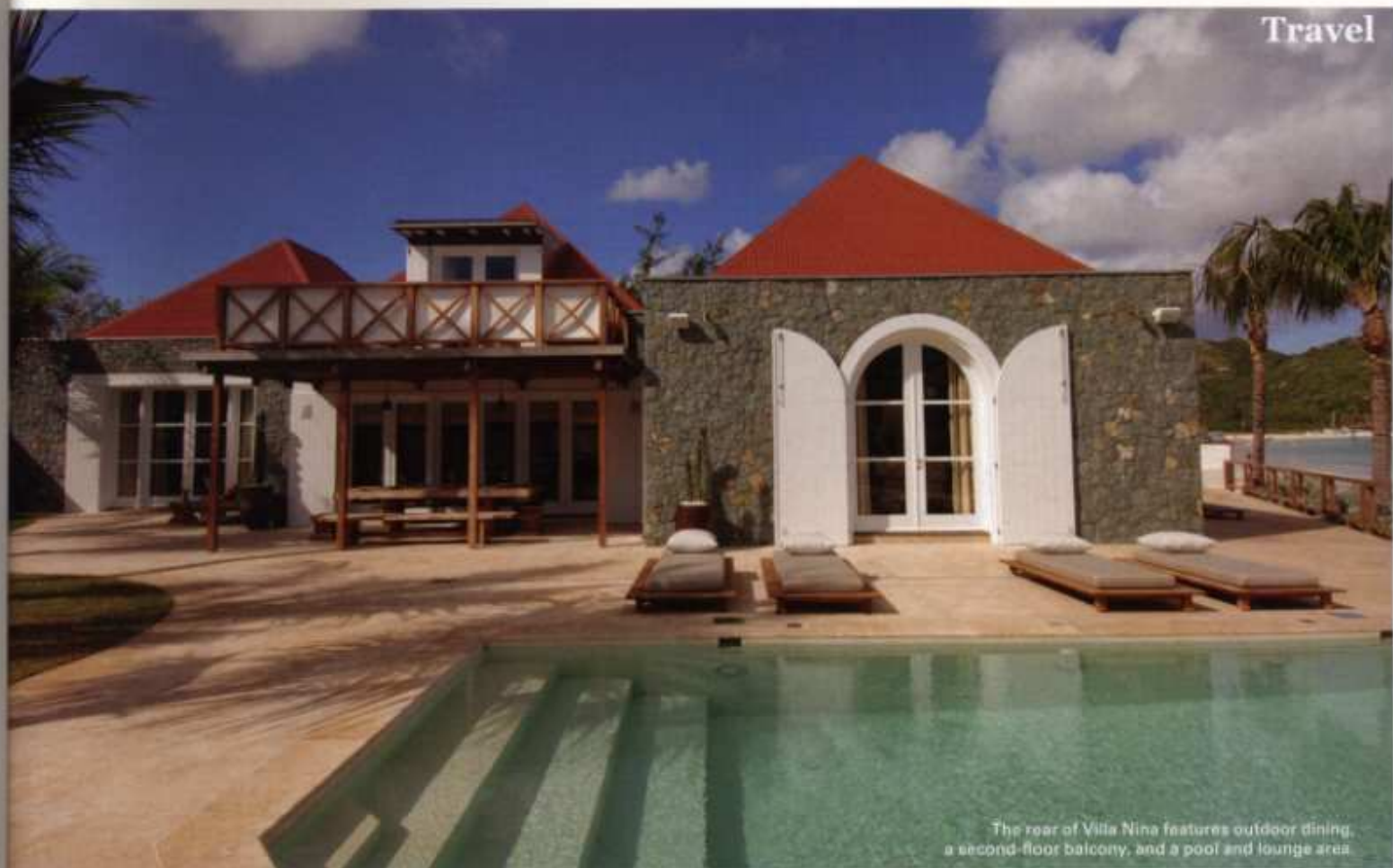
The rear of Villa Nina features outdoor dining, a second-floor balcony, and a pool and lounge area.